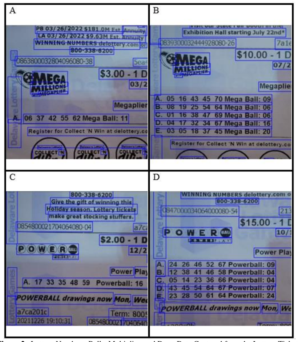
Figure 2. Lottery Numbers, Balls, Multiplier, and Draw Date Captured from the Lottery Tickets

Thus, changes are required in the application algorithm to maximize the utilization of mobile processors on smartphones (Akenine-Moller & Strom, 2008), while maintaining the image processing abilities of the application currently implemented as a Colab notebook. Since the current version of the application only supports PB and MM lottery tickets, adding functionality for other lotteries such as Cash4Life (Pennsylvania Lottery, 2022) and Lucky for Life (Lucky for Life Lotteries, 2022) would increase the reach of the application to a wider audience.