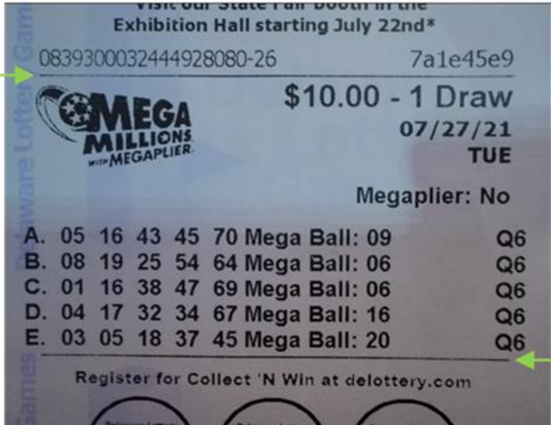
Figure 1. How to Take Picture of the Lottery Tickets

For faster processing and to obtain results within a shorter timeframe, the use of GPU is recommended (Castaño-Díez et al., 2008). Since the EasyOCR module supports GPU (JaidedAI, 2022), the application utilized the Tesla V100-SXM2 GPU with 16 GB memory to produce the results presented in this article (Xu et al., 2018). Furthermore, to increase the accuracy of text recognition, it is recommended that the user takes a picture of the content provided within the black demarcation lines on the lottery ticket. This is indicated in Figure 1 by the green arrows. Since it can be tedious to only include information within the black lines, it is not a strict requirement but a recommended guideline. Even if the picture contains content information beyond the black demarcation lines, the application can still obtain Lt, Ldt, 5d, 2db, and m information accurately.