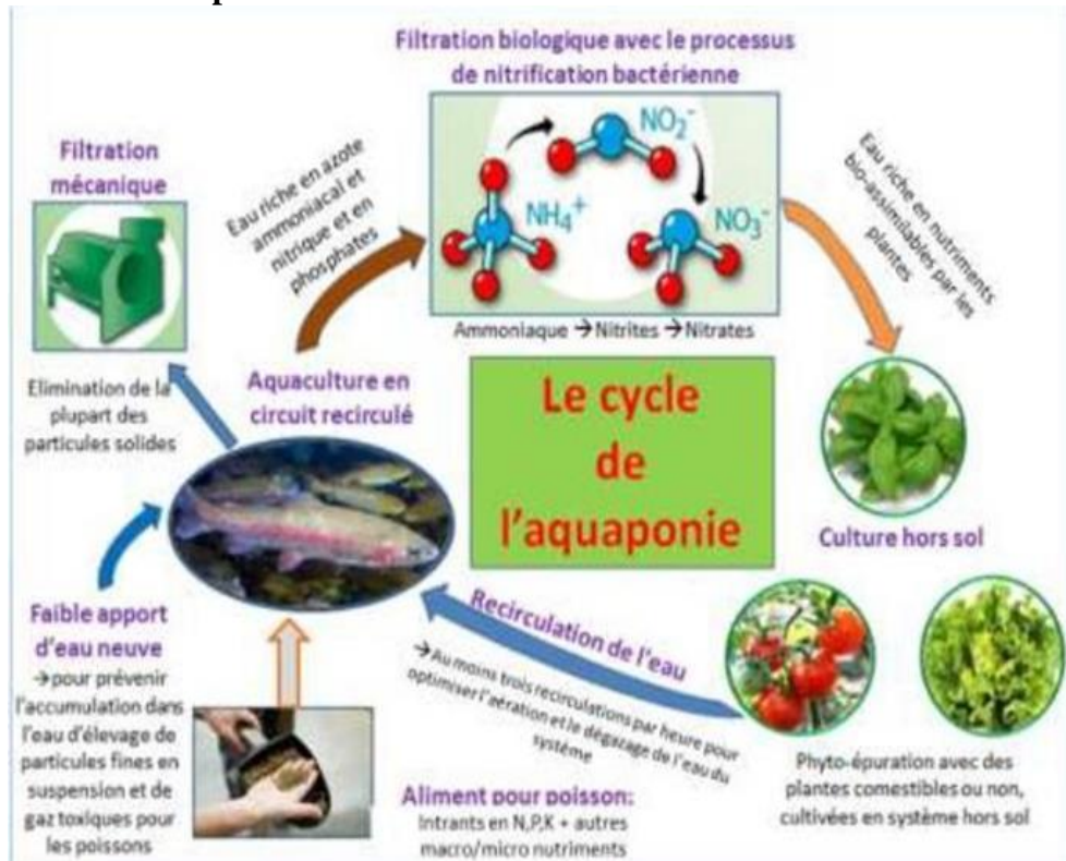
Figure 3. Principle of an aquaponics system (Foucard et al. , 2015)

In aquaponics, much of the plant nutrients can come from organic sources such as fish excrement, waste from food scraps, or the breakdown of algae and other microorganisms growing in the water. The idea is simple, but the implementation is complex. In their pond, fish release ammonia and phosphorus. Instead of being discharged into the environment as is the case with conventional aquaculture, this water is filtered mechanically and then biologically, in this case in a tank containing bacteria fixed on plastic supports: first Nitrosomas sp. which transforms ammonia nitrogen and urea into nitrite, then Nitrobacter sp. which transforms nitrite into plant-assimilable nitrate (Fujiwara et al. , 2013). Indeed, a large part of the nitrogen released by fish is in the ammonia form, which is toxic for them and not very valuable for plants.