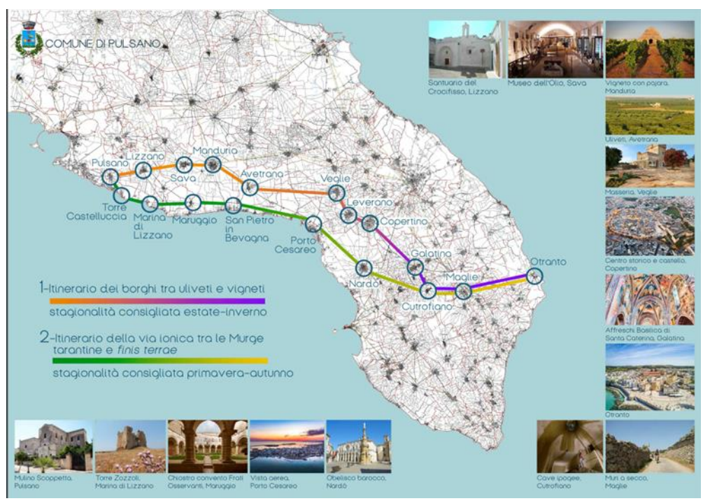
Fig.5: The stages of the two planned routes