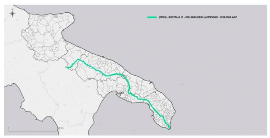
Fig.3: The Apennine cycle route (from PRMC)

The Apennine Cycle Route intercepts the municipalities of Nardò, Veglie, Avetrana, Manduria, which are part of our two routes, and the RP06/BI14-Cycling of the Three Seas.