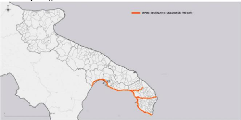
Fig.4: The Three Seas cycle route

The Apennine Cycle Route intercepts the municipalities of Nardò, Veglie, Avetrana, Manduria, which are part of our two routes, and the RP06/BI14-Cycling of the Three Seas.