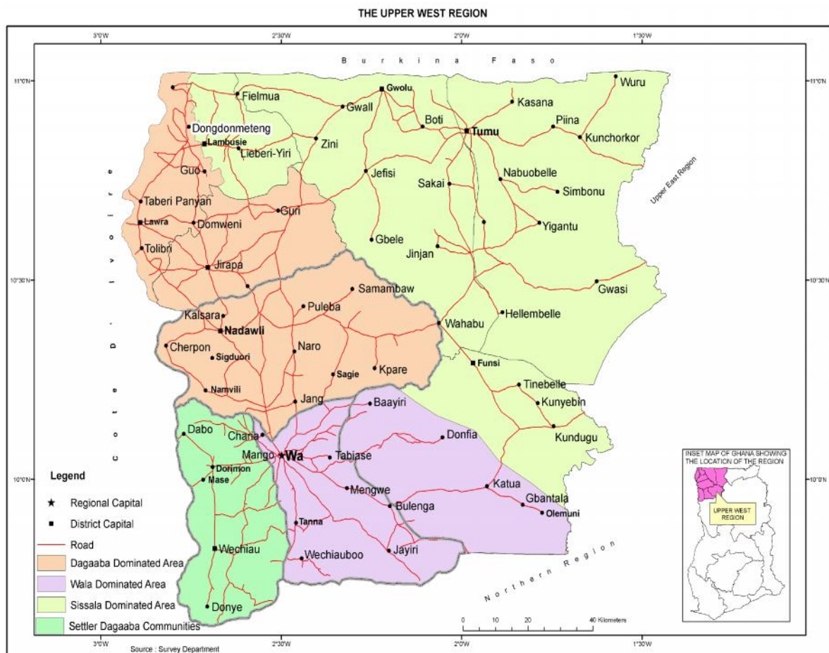
Fig 1: Areas with Majority of Dagaaba Residents