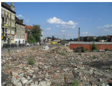
Fig.5. Fast traffic line DTŚ