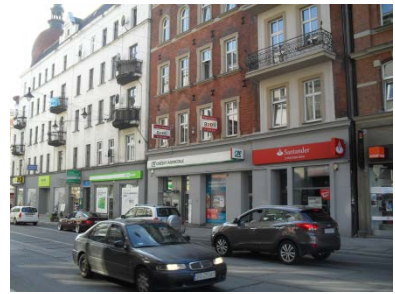
Fig.3. Banks on the Zwycięstwa str.

Recently, in the heart of the city there has appeared a huge gap-breach between buildings caused by constructing the fast traffic line DTŚ. It intersects Zwycięstwa Street near the railway station, breaks into the main axis – the city's backbone, destroys urban structures formed throughout the centuries, changes substantially the city's image. Such solutions are necessary for the region's functioning and creating its modern image, but unfortunately they destroy a part of the landscape shaped historically. Thus, valuable buildings and urban complexes, which guarantee the city's historical continuity, disappear. Such a view is one of examples of Polish cities which die in front of our eyes.