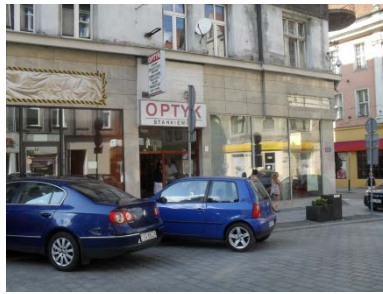
Fig.2. Closed shops in the main street