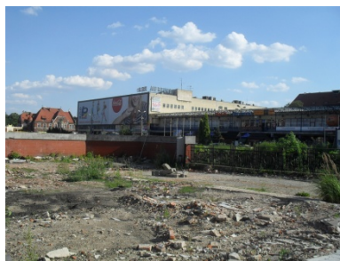
Fig.6. View from Zwycięstwa str.