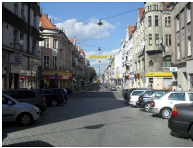
Fig.1. Zwycięstwa Street