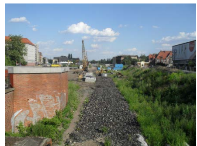
Fig.7. View - east side