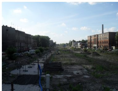
Fig.9. View - west side