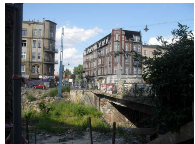
Fig.10. View from Zwycięstwa street