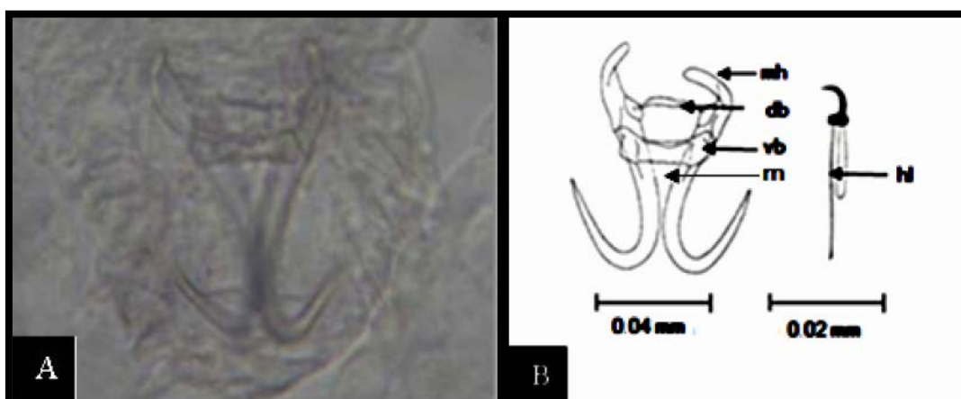
Fig (2): Gyrodactylus baikalensis .

ad= adhesive disc; b= blade; cad= central of adhesive disc; ci= cilia; r= ray.