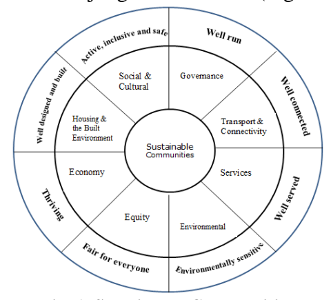
Fig. 1. Sustainable Communities

The Sustainable Communities Plan' published by the Milton Keynes and South Midlands Sub-Regional decision makers in 2006 suggests that there are a number of important components to new and established communities if they are to be judged sustainable (Figure 1).