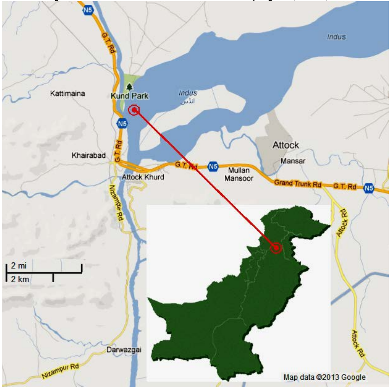
Fig. 1. The Indus River sediment soil and water sampling site (Red dot).