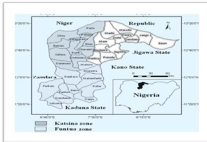
Appendix I: Map of Katsina State