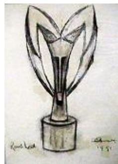
Fig. 8, Twisted Horn Mask , Pencil on Paper, 1991, Artist Collection