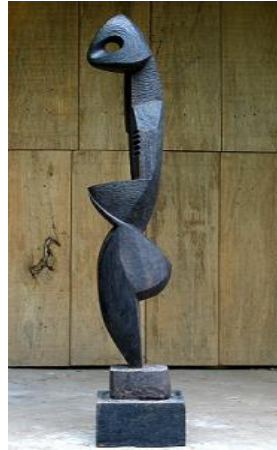
Figure 1b, Bronze Copy of Nature of Man , 1m ht, Bronze, 1970, Nymbus Gallery

Furthermore, he went as far as defining the head and the area suggesting the socket of the eyeballs. Rather dramatically he accentuated the various textures and subtle contours that became the hallmark of the art-form. As he drew in pencil, he visualised and resolved challenges of proportionality and movement of the sculpture as we can observe in figure 2 of the same art-form in bronze. As noticed in the pencil drawing, the directional movement of the head, the stomach and buttocks where clearly resolved, so that when reproduced in bronze it became perfected.