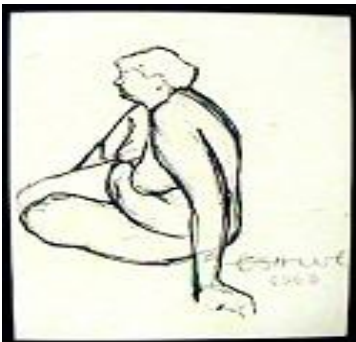
Fig. 7, Elizabeth , Pencil on Paper, 1963, Artist Collection