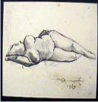
Fig. 3, Sleeping Model , Pencil on Paper, 1969, Artist Collection