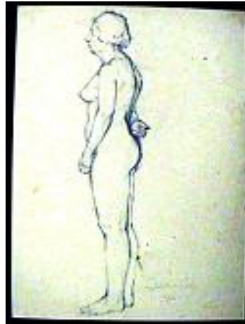
Fig. 6, Standing Model - Elizabeth , Pencil on Paper, 1963, Artist Collection