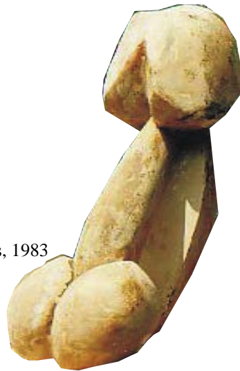
Figure 2b, Libido, 95cm Ht, Fibre Glass, 1983 Artist's Collection

In figure 2a above, we observe clusters of 8 drawings executed with pen on paper. As we encounter this undated composition, we enjoy the dexterity and forcefulness that was brought to bare in this drawing. Despite the obvious fact that they were made with pen, we nonetheless enjoy Osawe's resourcefulness in showing depth, light and shade and textures. At the end, he again demonstrated the three dimensionality of sculpture in this composition on paper.