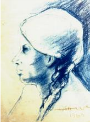
Fig. 5, Head of Alice , Crayon on Paper, 1963, Artist Collection