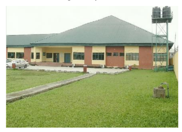
Outside view of the Model Primary School Rupkokwu.

a resident nurse, staff quarters and a dormitory. Presently, 400 of these primary schools have been completed and 4 out of the 24 secondary schools being built have being completed also. Each of these schools cost approximately 12 million naira and a total cost of 84 billion naira or 560 million U.S dollars. The State government is investing so much in building these primary schools in order to address the poor decay and dilapidated infrastructural facilities in various primary schools in the State. The following pictures show some of the efforts of the Rivers State government in the provision of physical facilities and quality learning environment in primary schools in the state.