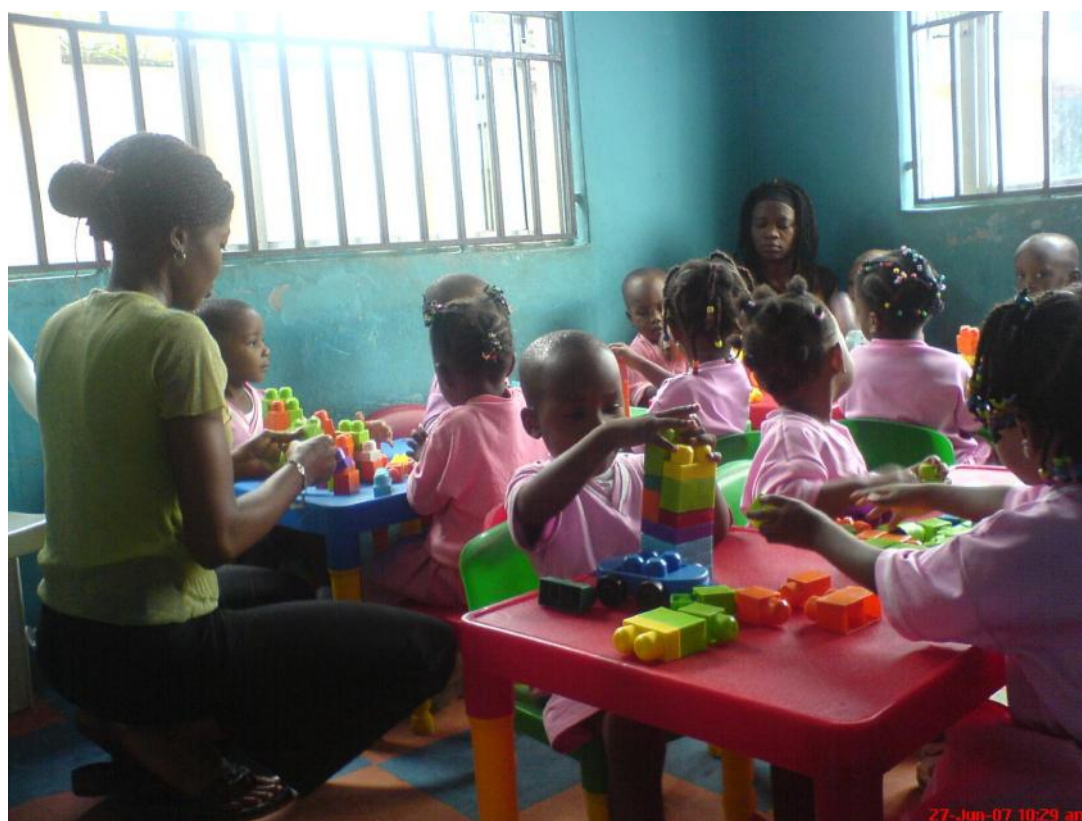
Fig.1: Utilisation of Instructional materials – manipulation of building blocks

Storing Materials - Materials should be stored where they are most frequently used, or where it is first used and located in logical place. Children can go and get things themselves to complete an assignment if they know where they are located. This is most important for common items like paper, crayon, scissors, and the like. Children will find it difficult selecting materials on crowded shelves. Sometimes it is unsafe. Materials should be displayed on low open shelves accessible to the children.