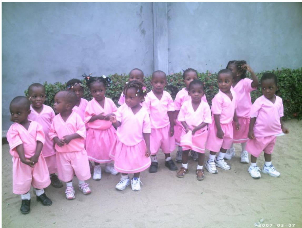
Fig.2: Playground - Free from hazards

building, each part of the building should have correct orientation as to natural favour ventilation.