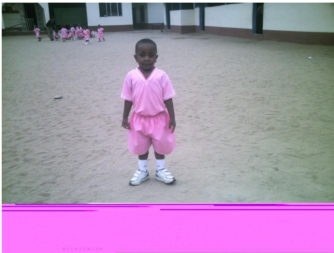
Fig.3: Quality Space – standard size

developmental progress and also enhance and support caregivers in implementing quality programme.