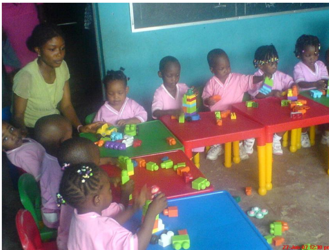
Fig. 5: Organised material utilisation – adequacy of materials