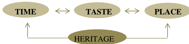
Fig.1-What influence heritage

Christian Norberg-Schulz, in Genius Loci - Towards a Phenomenology of Architecture states the importance of place, and how can establishing its character and its essence, without forget the population. How often people identify themselves is done according to the places and defines the identity concept. As Norberg-Schulz referred the meaning of genius loci as a result of three fundamental ideas: identity, history and tradition (NESBITT, 2008, 457). Identity is determined by the location, the general spatial configuration and the characteristic link of each place. History demonstrates the impossibility of a place, the surroundings, be subject to continuous change. Finally the tradition is the result of the union between identity and history of the place.