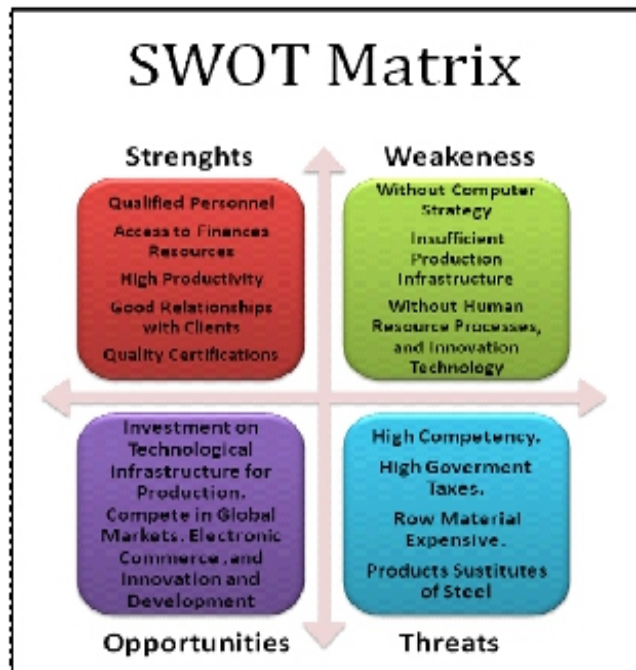
Figure 2: SWOT Matrix

The SWOT matrix shown in Fig. 2 for the manufacturing companies, give some insights about the state of this industry and how the model can be emphasized in terms of its weakness and threats (Valdez & Cortes, 2014).