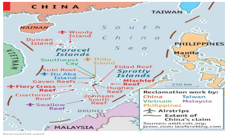
Figure 2. Map of disputed area in the South China Sea (Economist, 2015)

Picture above depicts the disputed area which has increased states' security level in the region. If parties involved keep assert their power leverage through for instance China and its reclamation at Paracel Islands, I would predict a conceivable predicament surrounding the South China Seas could grow worse in the couple years ahead.