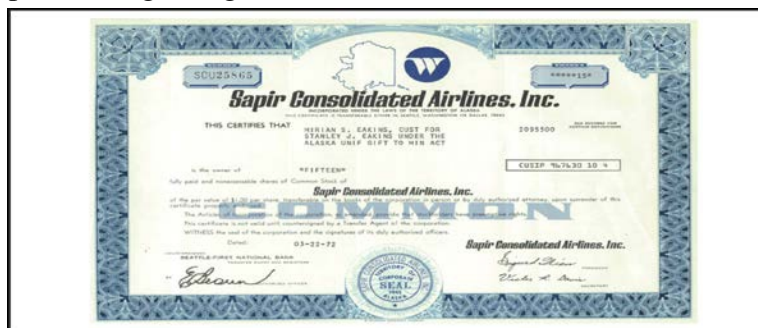
Figure 1. Example of a stock.

The two, already familiar, types of stocks are the common and the preferred ones. As mentioned in the previous paragraph, common stockholders have the right to vote, to receive dividends and an extra return if the price goes higher. There might be another classification inside this group of stocks that is related to the way the dividends or the voting rights are distributed in different companies and that can be a very good lead for the investors when deciding to buy shares in these companies. But somehow this is not very reliable because these classes let's say do not have a standard meaning across all companies i.e if we call these classes of stock for example A or B etc., it doesn't necessarily mean that an A stock in Apple Inc. is the same as an A stock of McDonald because these companies may have different policies regarding the dividends distribution.