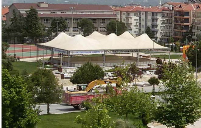
Picture 3. Denizli Synthetic Ice Rink

Republic of Turkey Prime Minister’s Disaster and Emergency Management Authority (AFAD) conducted a questionnaire study to learn the refugees’ profiles in 2013. 32.8% of the 7,860 refugees who responded the questionnaire at 1,420 housing units in the temporary shelter area said their houses were completely damaged/demolished, and 17.1% said they were massively damaged; while 28.7% of 7,320 people who are staying at 1,160 housing units outside of the shelter area said their houses were completely damaged/demolished, and 14.9% said they were massively damaged. It can be inferred from the answers “completely damaged/demolished” and “massively damaged” that approximately half of the people’ who live in shelters (49,9% and 43,6% respectively) have houses which became uninhabitable in Syria (2).