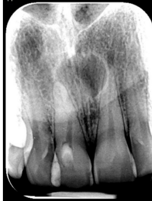
Figure 1. Conventional radiograph showing misdirected search of canal entrance, almost perforating the mesial wall of the root.

The CBCT scan revealed a somewhat palatally positioned canal entrance both in sagittal and horizontal sections (Figure 2 and 3).