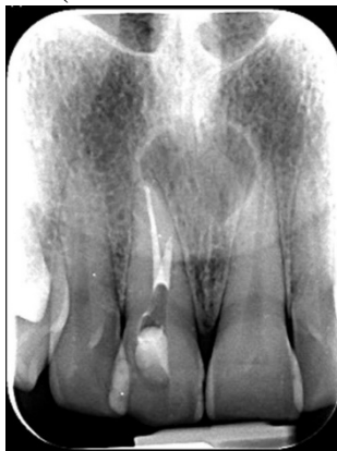
Figure 4. Periapical radiograph showing the filled canal and via falsa.

For the following clinical procedures an operating microscope was used in order to have magnification and proper illumination of the root canal. A long shank carbide bur at low speed was used to align the access cavity to the long axis of the tooth and the dentin was moistened with EDTA gel. The first instrument was a K-file # 10 (Dentsply, Maillefer, Tulsa, USA) that established the glide-path to the working length and then rotary files MTwo (VDW GmbH, Munich, Germany) were used in the sequence indicated by the manufacturer as follows: 10/.04; 15/.05; 20/.06 and 25/.06. The root canal was irrigated with 25-30 ml of sodium hypochlorite 5, 25% heated at 50 0 C. Both the root canal and the false canal were filled with 25/.06 tapered guttapercha cones and Adseal (Meta Biomed Co. Ltd., Korea) (Figure 4).