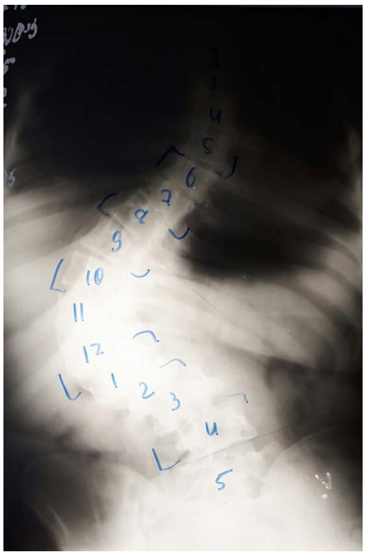
(Fig. 2). X-ray in dinamic showed the progressive deformation of the thoraco-lumbar vertebrae in dynamics in a patient with Marfan syndrome, there is loss of the normal vertebral concavity associated with progressive antero-lateral growth reduction with exaggeration of vertebral flattening associated with the development of marginal osteophytes Th10, Th11. Ligamentous laxity is also a cause of the precocious axial osteoarthritis in Marfan syndrome.

also a cause of the precocious axial osteoarthritis in Marfan syndrome (Fig. 2).