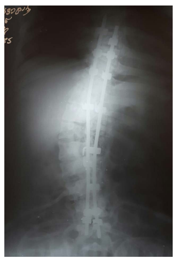
(Fig.3): Operative procedure was planned in one steps. First, a ventral release was done at the level L1/L2, L2/L3, L3/4, L4/L5. The dorsal fusion with CD instrumentation of L1, L2, L4, Th7, Th8, Th9, Th10, Th12 with spinal husk fixation in the right position was done. After neurologic control in anesthesia, the fusion was prepared by autografts.

Before the operation Cobbe angel was 85° and the patient had psychological problems for her spine deformity, but after the operation Cobbe angel was 25° (Fig.4,5,6,7). The patient returned to the normal rhythm of her life.