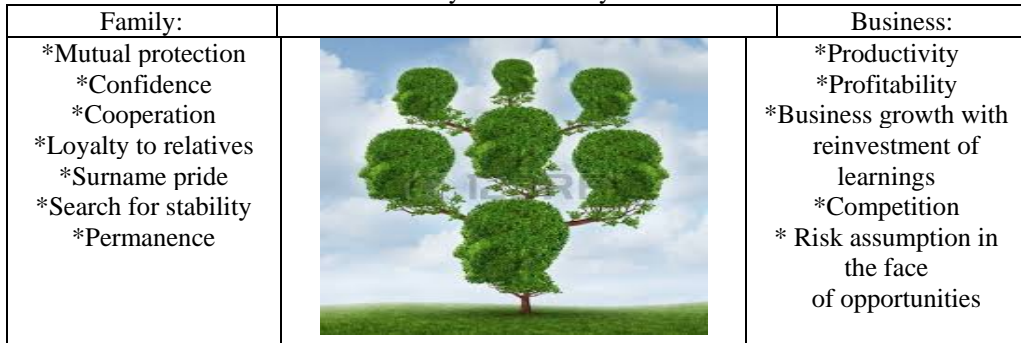
The two social systems: Family and Business

Professionals most related to this aspect are business or organizational psychologists, graduates in labor or human relations, specially trained psychiatrists; but any other professional can contribute to the firm, even if he/she lacks the specific academic training...all have something to say or recommend!