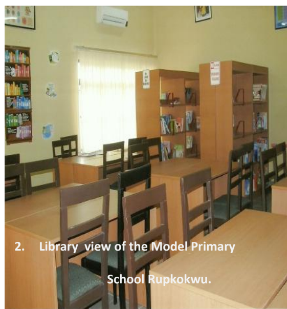
2. Library view of the Model Primary School Rupkokwu.