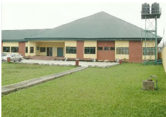
1. Outside view of the Model Primary School Rupkokwu.

a resident nurse, staff quarters and a dormitory. Presently, 400 of these primary schools have been completed and 4 out of the 24 secondary schools being built have being completed also. Each of these schools cost approximately 12 million naira and a total cost of 84 billion naira or 560 million U.S dollars. The State government is investing so much in building these primary schools in order to address the poor decay and dilapidated infrastructural facilities in various primary schools in the State. The following pictures show some of the efforts of the Rivers State government in the provision of physical facilities and quality learning environment in primary schools in the state.